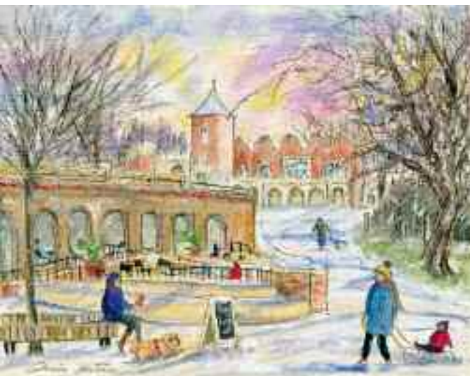
The new café yard, by Catherine Masterman

Works to re-arrange the road in front of the café led to a summer of disruption for café users, and at the time of writing (1 September) the area is still a little raw and with temporary screens. In time we hope it will be altogether greener. Our Christmas card this year shows how it will look once it has settled in and is attractive in its own right. We will hold a ready supply of these cards in both the standard 152 mm x 197 mm format at £9.50 the pack of ten, and the small