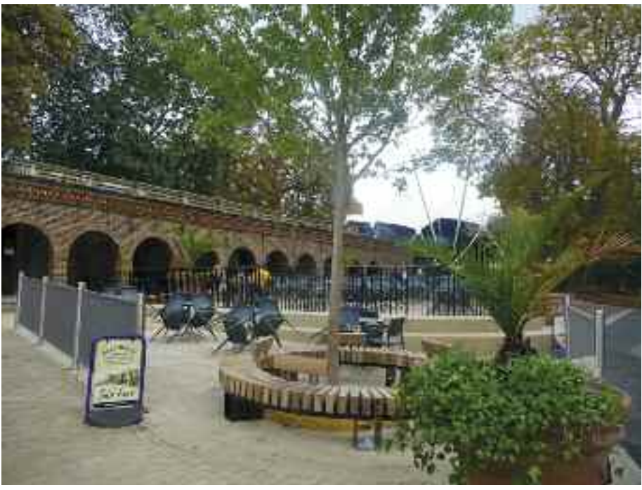
The café yard