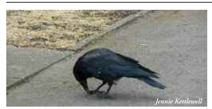
Carrion crow in the park