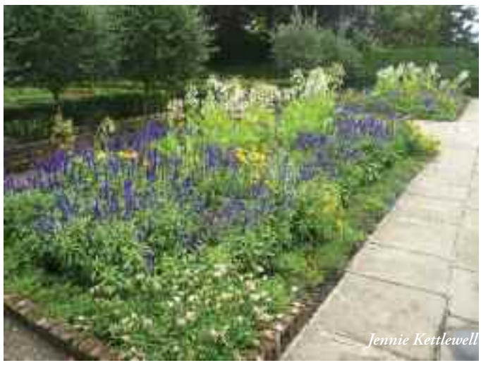
Flowerbed in the Dutch Garden

Holland Park to the absolute minimum, and they are only ever applied by trained experts.