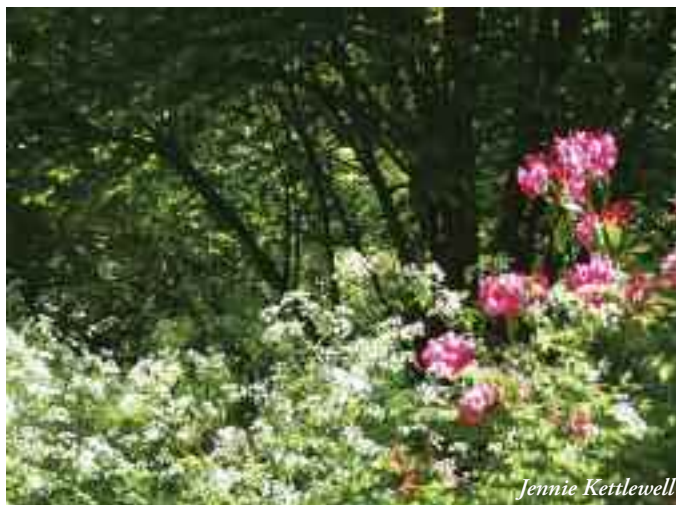
Beautiful trees and flowers to the east of Acer Walk

At its simplest, the park is a safe green space for the enjoyment and wellbeing of the local community. That is not to say we do not welcome visitors, of course we do, and they will come anyway, but primarily the residents of the densely populated borough of Kensington and Chelsea need this green space so that they can get out into the fresh air, exercise, walk the dog, let the children play, or just sit under a tree and reflect.