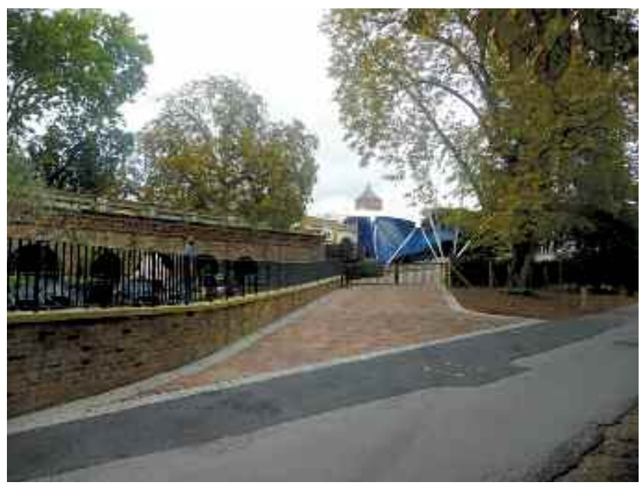
The Road to the House terrace

The renovation work has taken far longer than expected and the end date is still not clear. Not only would we all like a view of the elegant tower on this listed building, but I think many will be pleased to see the contractor's compound and equipment removed