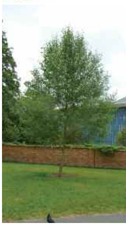
poplar is planted next to the Commonwealth Copse, just north of the Design Museum. It was given a robust metal cage to keep it safe. But it did not: it got sick. On a visit to the tree with Bartlett Tree Experts in November 2017, we found a bad case of rust on the leaves, which is eventually fatal. There was damage where the cage had bitten into the trunk.