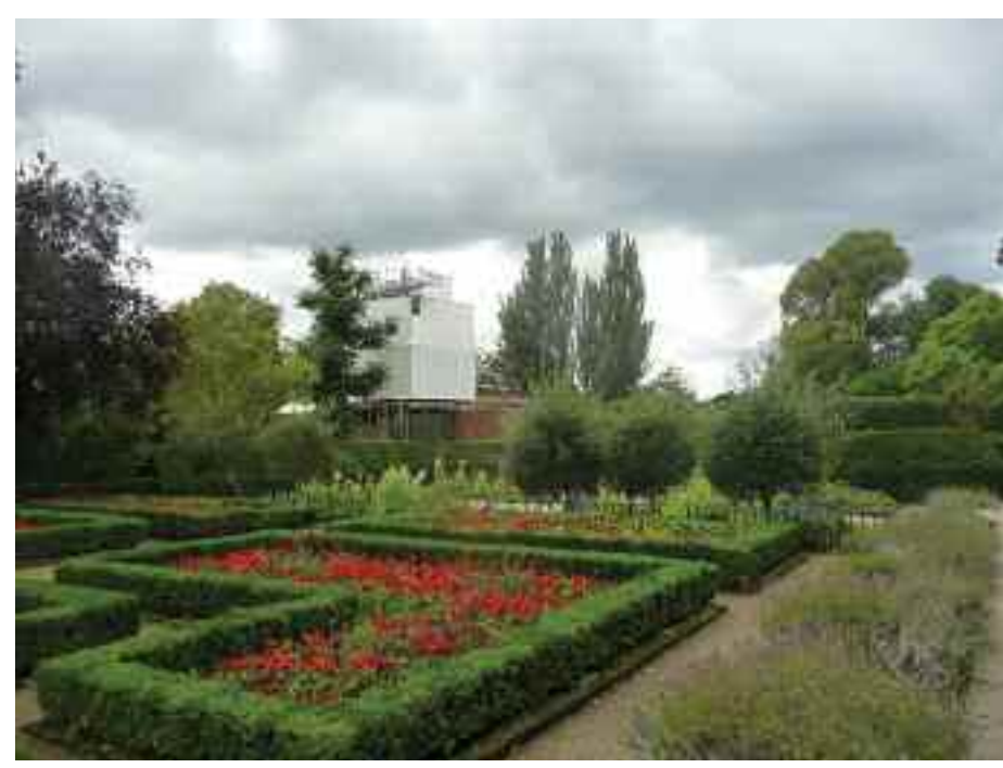
The Belvedere tower seen from the Dutch Garden from the car park, where it takes up an unacceptable amount of space.