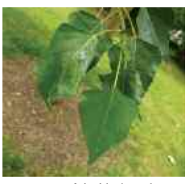
Leaves of the black poplar

This is now one happy little tree. Duplicate that many times over and we will have a very healthy tree stock in Holland