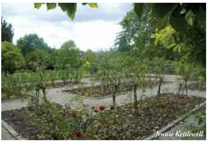
Rose Garden in 2018

so what fascinated me was the account of the description of Holland Park in the 1970s, a period for which there are few records.